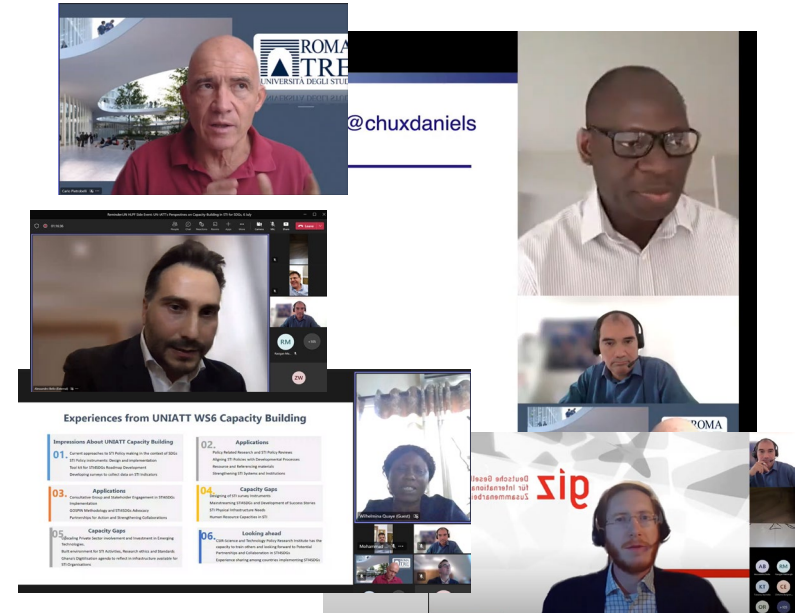
Panelists sharing views on STI policy capacity building and its partnerships during the 2022 HLPF side event

Three (3) STI Forum side events (2021 , 2019 and 2018)