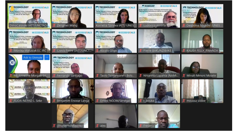
Group photo for the 2021 SADC training